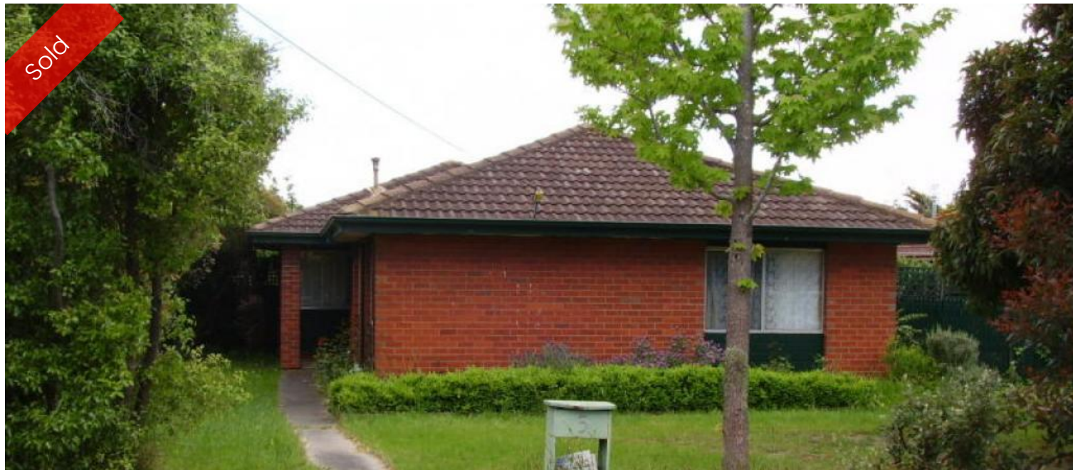
5 Hawthorn Cresnet "UNDER CONTRACT", Churchill