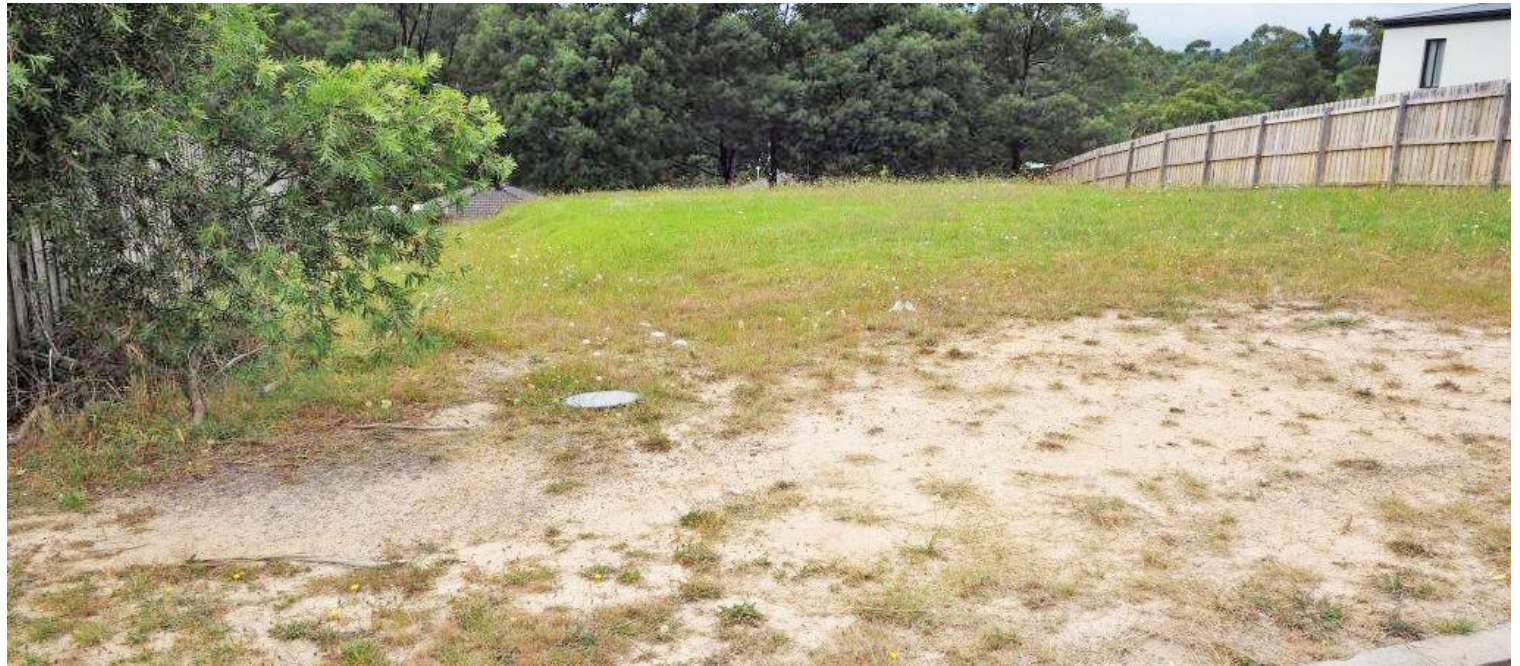
3 Omaru Court, Churchill