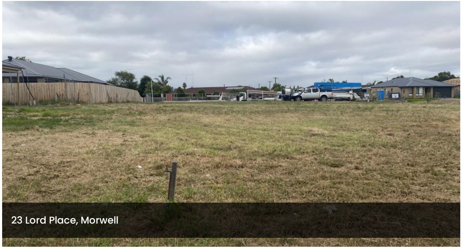
23 Lord Place, Morwell