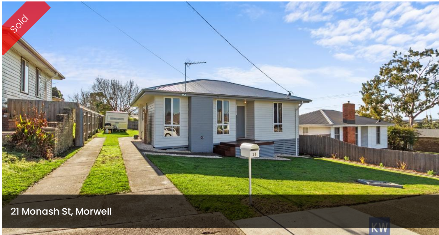
21 Monash St, Morwell