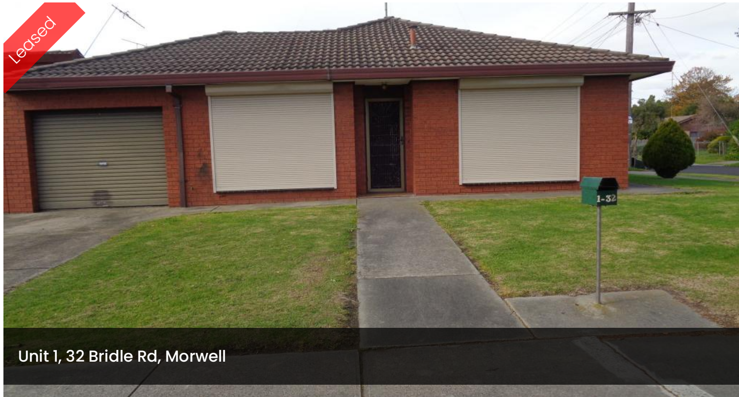
Unit 1, 32 Bridle Rd, Morwell