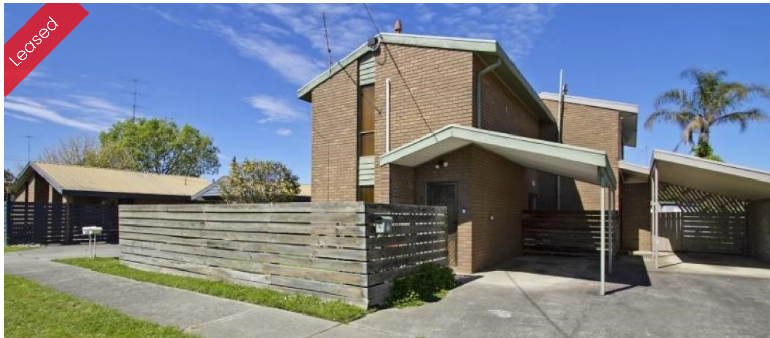
Unit 5, 19 Hopetoun Ave, Morwell