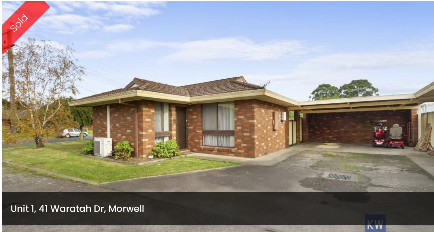
Unit 1, 41 Waratah Dr, Morwell