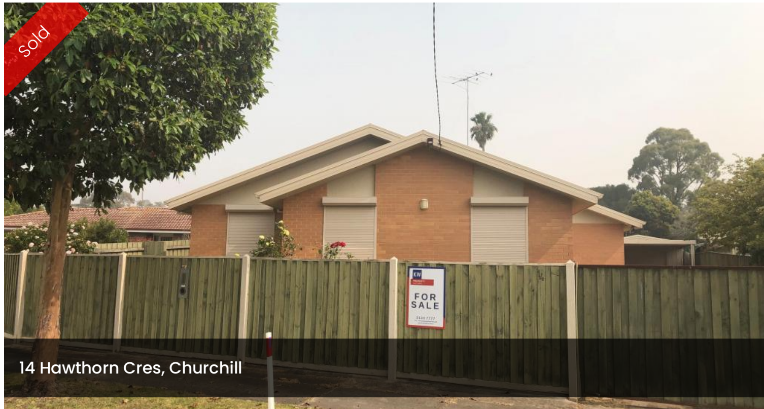
14 Hawthorn Cres, Churchill