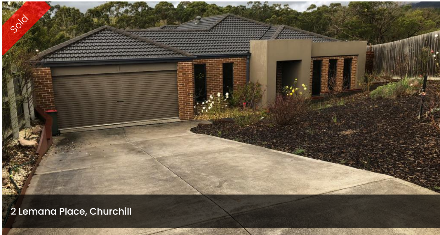
2 Lemana Place, Churchill