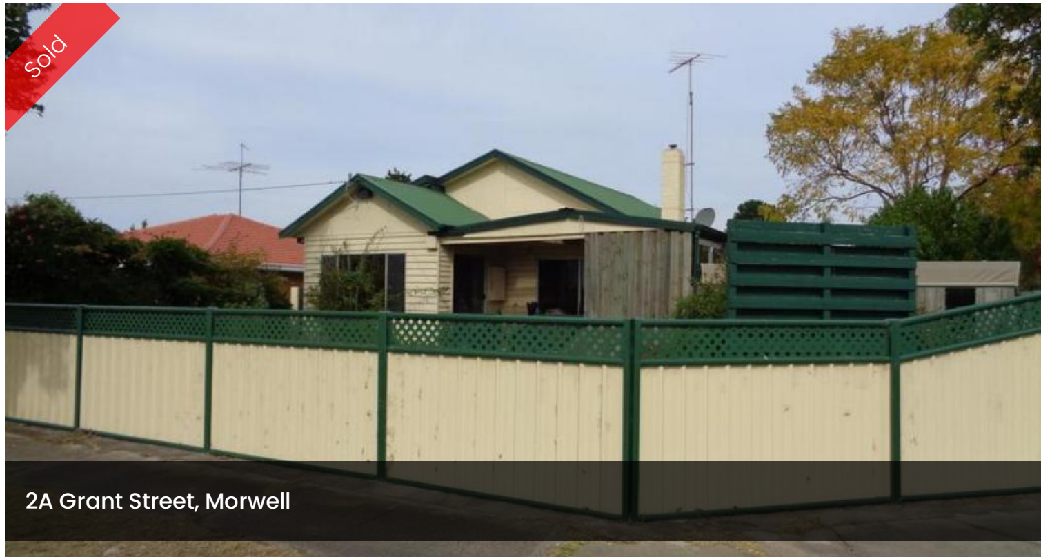
2A Grant Street, Morwell