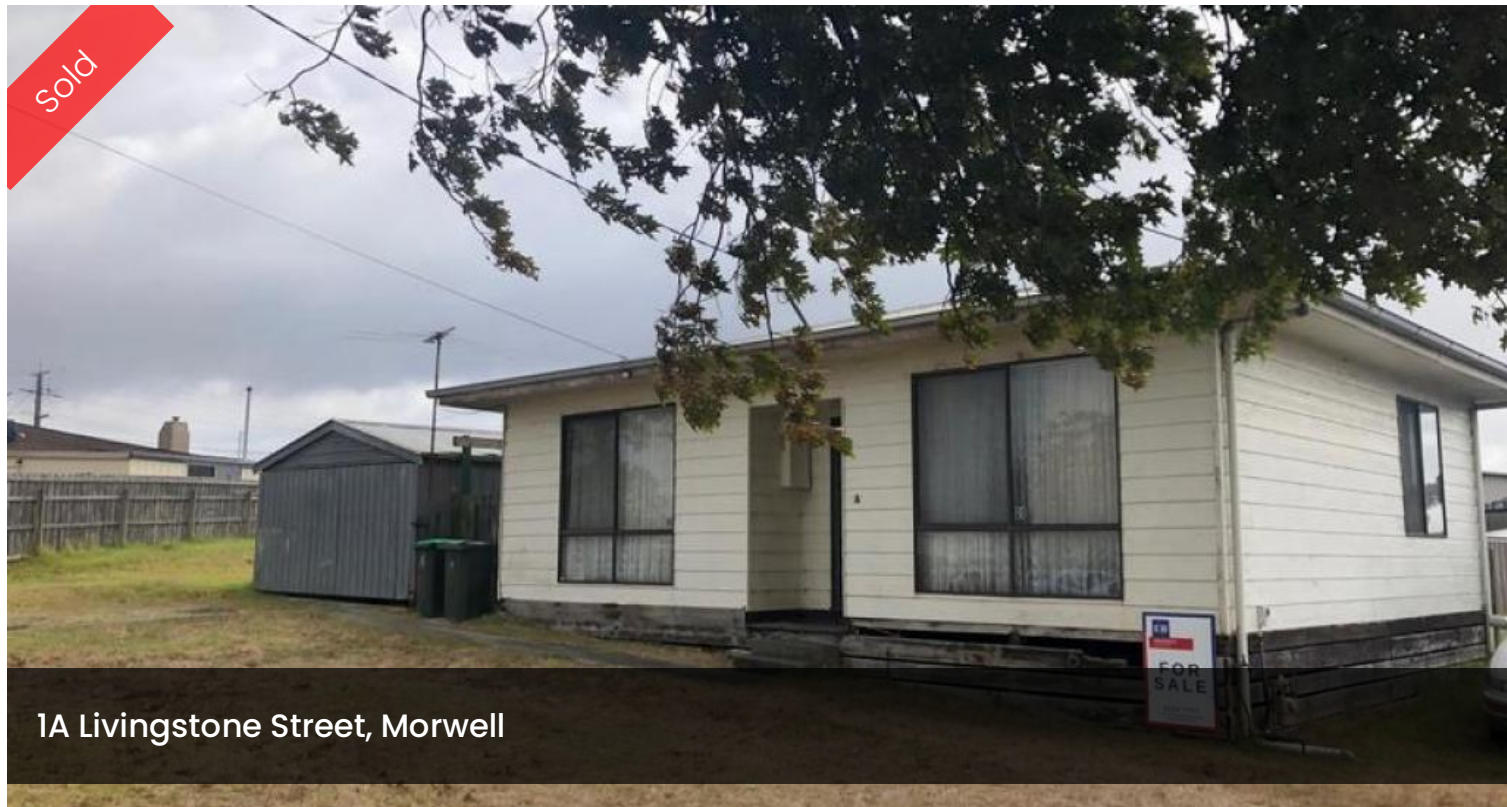
1A Livingstone Street, Morwell