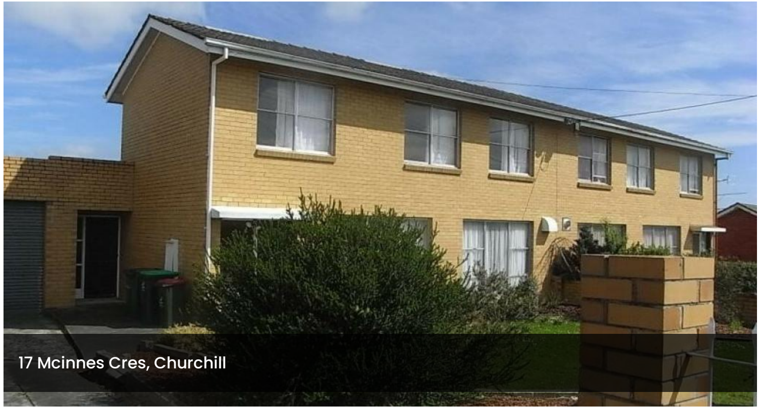
17 Mcinnes Cres, Churchill